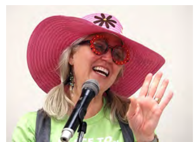
Thank you for a year full of terrific memories and your suppport