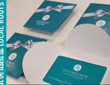
The PERFECT holiday gift!